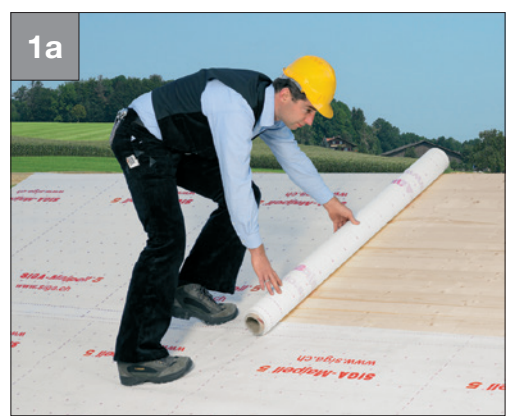
Above-rafter insulation with Majpell 5:

• Lay Majpell 5 with the smooth side and the writing facing you